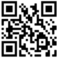
Instruction video on how to upload documents