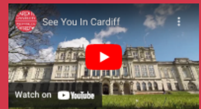
See you in Cardiff - 2.42 mins