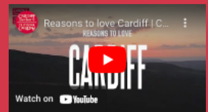
Reasons to love Cardiff - 1.05 mins