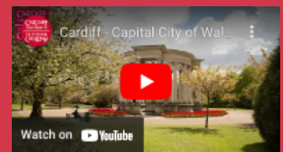
Cardiff - Capital of Wales - 1.35 mins